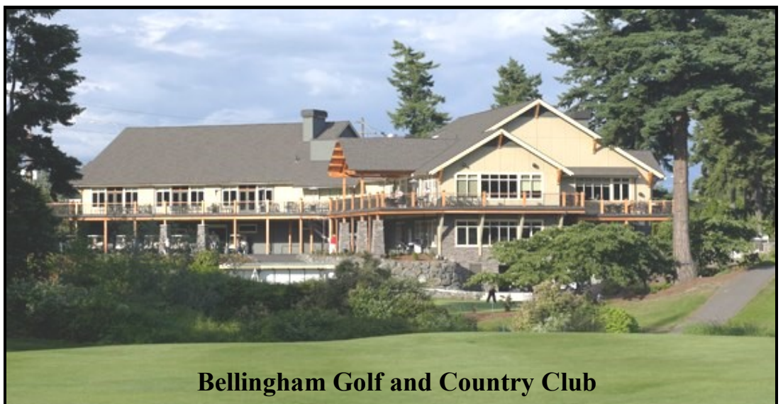
Bellingham Golf and Country Club