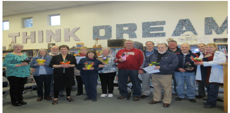
The entire 18 retirees that attended the celebration