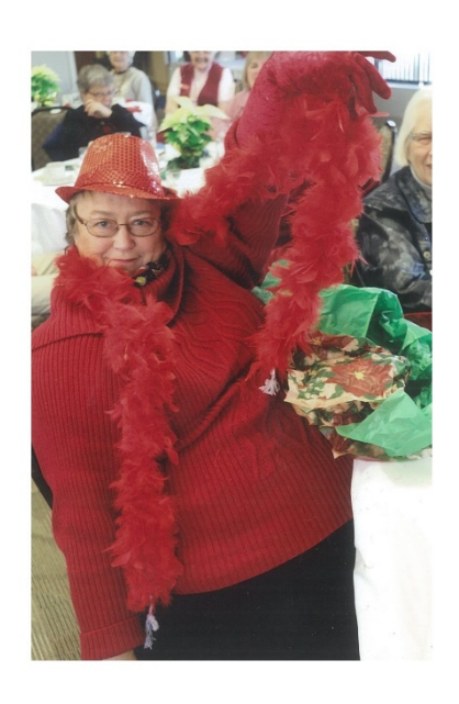
Red Hot Christmas Mama