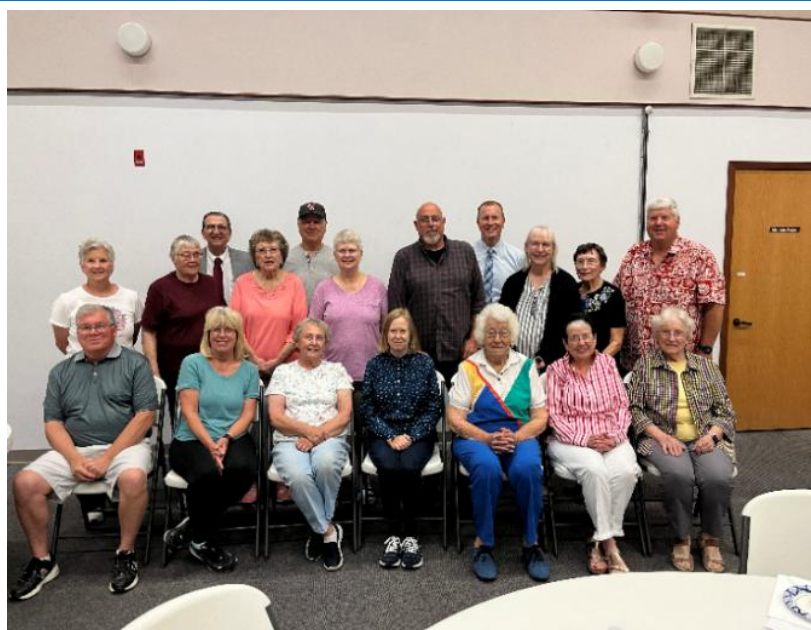
OCSRA members at the May 27 meeting, Community Presbyterian Church of Omak

WSSRA 79 th Convention: June 8 - June 10: Great Wolf Lodge in Grand Mound